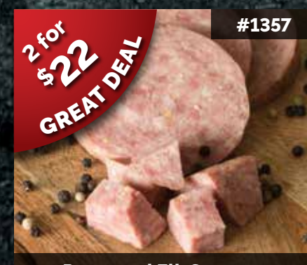
Peppered Elk Sausage