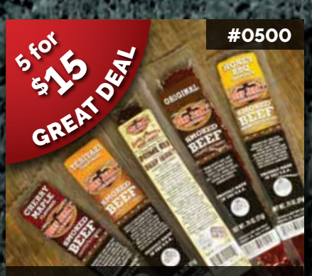
Beef Snack Flats Pack